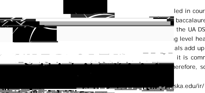
Table 1.50 Alaska Education Grant (AEG) Recipient Headcount and Student Credit Hours (SCH) by Class Standing and Academic Organization, Fall 2023

led in courses offered by the student's program AO are reported at the 📲 baccalaureate level). UA degree seeking (UA DS) students taking courses the UA DS level. Credit hours taken by non-degree seeking students are g level headcount is unduplicated and headcount includes students who als add up to more than University totals and University headcounts add it is common for students to be concurrently enrolled at multiple AOs erefore, some students would be double counted if headcounts were